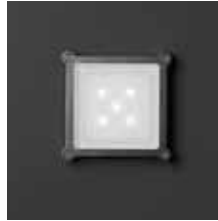
BADGE 150, 5 LED