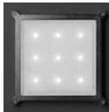
BADGE 230, 9 LED