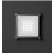
BADGE 150, 36 LED