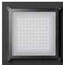
BADGE 230, 100 LED